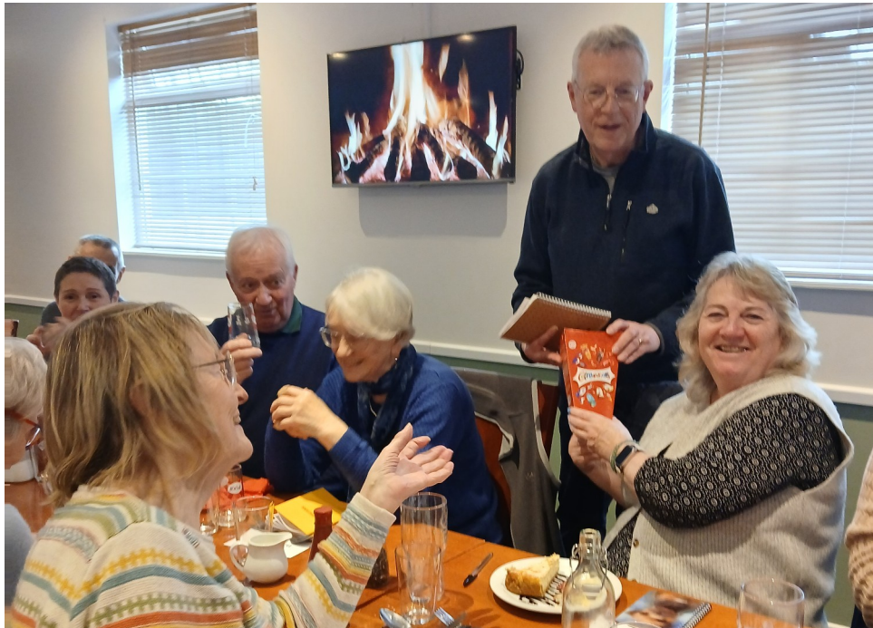
The winners of the 10 question quiz, held between main course and dessert!