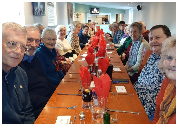
29 of us having a great lunch at the Merry Harriers